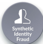
Synthetic Identity Fraud